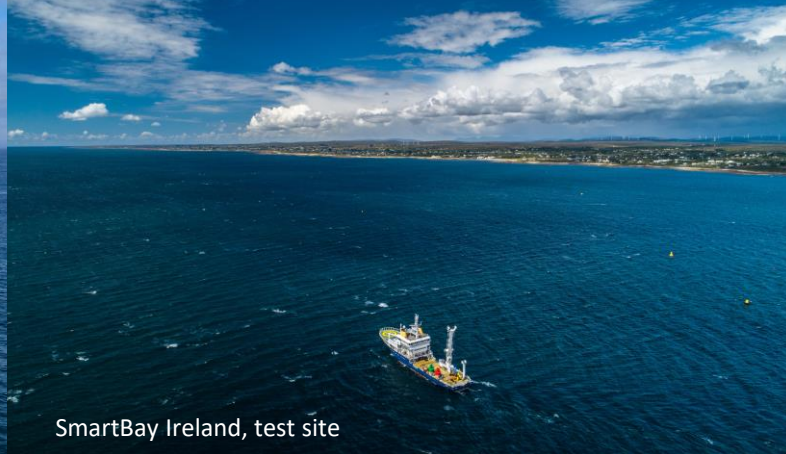
SmartBay Ireland, test site