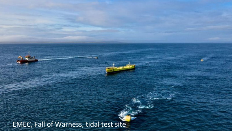
EMEC, Fall of Warness, tidal test site